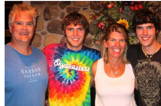
Glad the boys don't look like their dad!